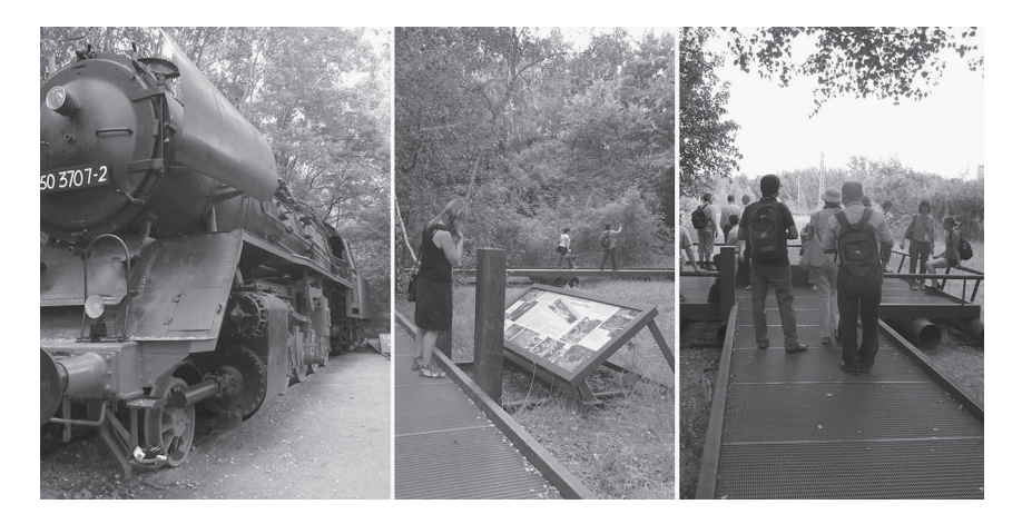
FIGURE 27.4. Natur-Park Südgelände in Berlin resulted from the efforts of civically engaged residents.

citizens knowledgeable about the benefits of open and multifunctional spaces supported the revitalization of an urban green space. In the 1980s, local residents formed a nonprofit organization to protect an eighteen-hectare railyard. The railyard had been abandoned for five decades during Berlin's separation of East and West, a circumstance that allowed the landscape to regenerate while untouched by development. Despite the area's proximity to a densely populated neighborhood, civic activists and professional planners influenced policy makers to protect it. Their efforts, along with ecological research, helped transform the area into the Natur-Park Südgelände, opened in 2000 (Kowarik and Langer, 2005) (Figure 27.4). The park offers a model for green infrastructure that fosters a strong sense of place for residents by nurturing cultural values related to art, education, and sport. In this way, it also provides opportunities for education in and of green infrastructure.