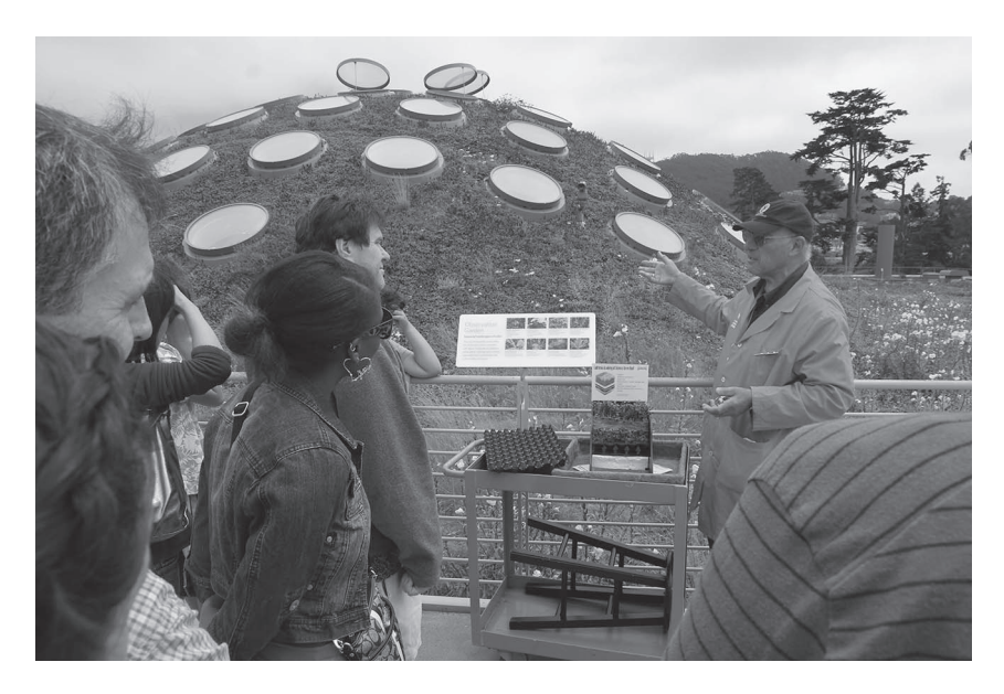
FIGURE 27.3. At the California Academy of Sciences in San Francisco, California, United States, a docent educates visitors about ecosystem services provided by the green roof, including insulation, storm water control, and fresh air, which help the academy and surrounding parkland thrive.

In general, ecosystem services refer to those ecosystem functions of green infrastructure that are used, enjoyed, or consumed by humans. Ecosystem services can be categorized into four types: provisioning services (e.g., drinking water, raw materials, and medicinal plants); regulating services (e.g., pollination, water purification, carbon sequestration, flood control, climate