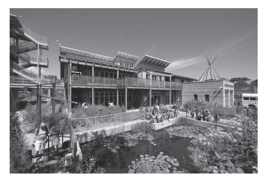
FIGURE 27.2. The Riverside Park branch of the Urban Ecology Center, Milwaukee, Wisconsin, United States.

Despite the potential to use place-conscious education and systems thinking to advance sustainability education, current public educational models face challenges in using these approaches. Such strategies may require additional financial resources and time from school districts and teachers. Moreover, some green infrastructure projects lack access and educational interpretation, making them difficult destinations for classroom field trips. Further, the place-based nature of education in green infrastructure may not align with more abstract, placeneutral methods of educational assessment that emphasize measurement and accountability. Challenges notwithstanding, examples around the world illustrate the potential of environmental education in green infrastructure. Cities, schools, and community organizations may need to collaborate and invest additional resources to unleash this potential.